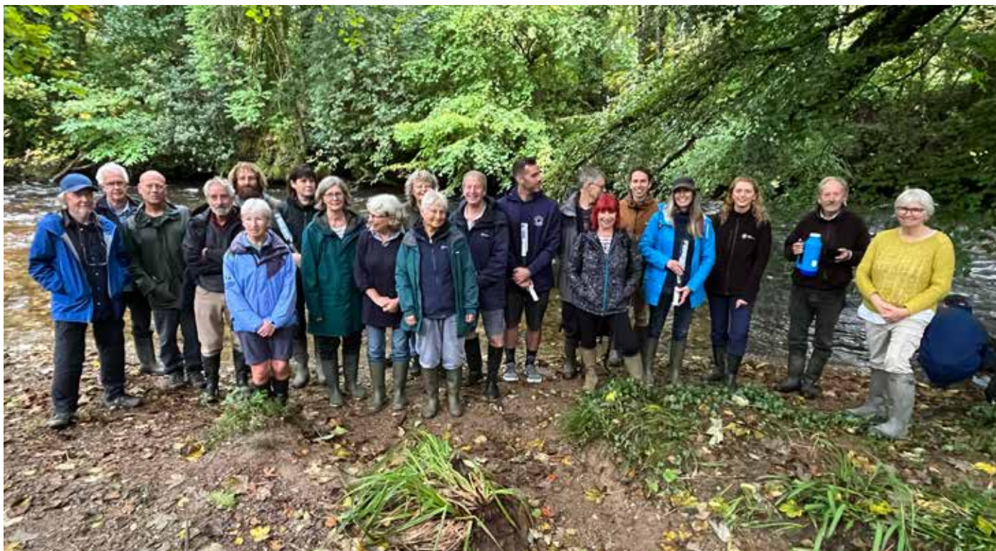
Citizen Science Investigator training by Westcountry Rivers Trust - River Avon

We are grateful for Letters of Support from: